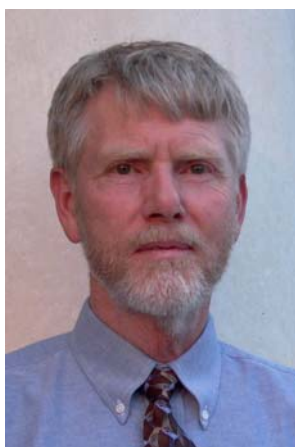
Member at Large Chair, Research Committee