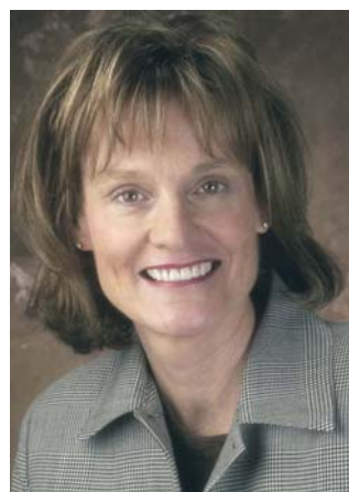
Member at Large Chair, Nominating Committee