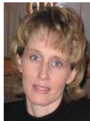
Member at Large Chair, Nominating Committee